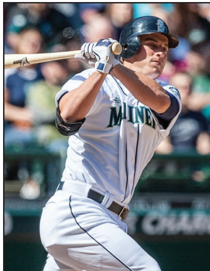
In 2012, his first full season, Seager hit .259 with 20 home runs and 86 RBIs.

weekend they were 28-18 and leading the AL West.